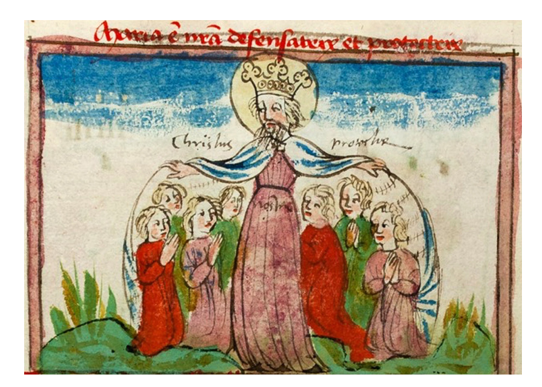
Fig. 8. Intervisuality and the history of use. Mother of Mercy (SHS 38 a) Rothenburg ob der Tauber, Konsistorialbibliothek (Stadtarchiv) WD 107, fol. 79 r