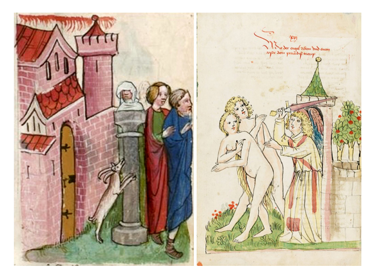
Fig. 4. Proliferation of motifs. Lot escaping from Sodom (SHS 31 d). Munich, Bayerische Staatsbibliothek, Clm 3003, fol. 29 v Expulsion from Edem ("Historienbibel"). St. Gallen, Kantonsbibliothek, Vadianische Sammlung, VadSlg Ms. 343 c, f. 9 v