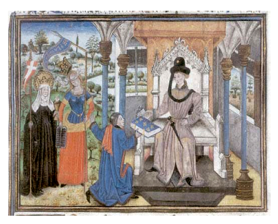
Fig. 11. SHS. Frontispiece. Glasgow, The Hunterian Museum Library, Ms. 60 (T.2.18), fol. 1 r