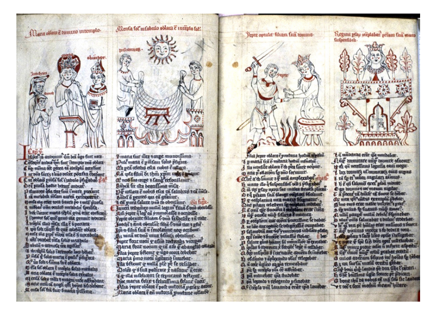
Fig. 2. Microstructure of the "canonical" SHS manuscript. The Presentation of Mary in the Temple (SHS 5 a–d). Berlin, Staatsbibliothek lat. fol. 329, fol. 5 v – 6 r