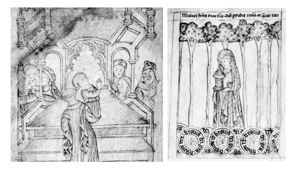
Fig. 6.1. Intervisuality and the tastes of a patron. The commission of the Bishop of Béziers. 1430–1450. Presentation of the Infant Samuel (SHS 10 d). Oxford, Bodleian Library MS Douce 204, fol. 10 v Source: The Warburg Institute Iconographic Database The Parable of the Lost Coin (SHS 35 c). Oxford, Bodleian Library MS Douce 204, fol. 35 v Source: The Warburg Institute Iconographic Database