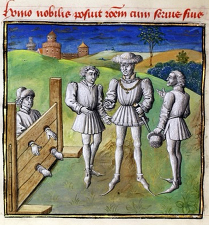
Mather rob & luce rix

Fig. 5. Specific details of the commission of the SHS manuscript. Philiip the Good as Gideon and as the Master from the Parable of the Talents. The miracle of Gideon and the Fleece (SHS 7 c). Chicago, Newberry Library 40, fol. 8 r Source: The Warburg Institute Iconographic Database The Parable of the Talents (SHS 40 b). Chicago, Newberry Library 40, fol. 40 v Source: The Warburg Institute Iconographic Database