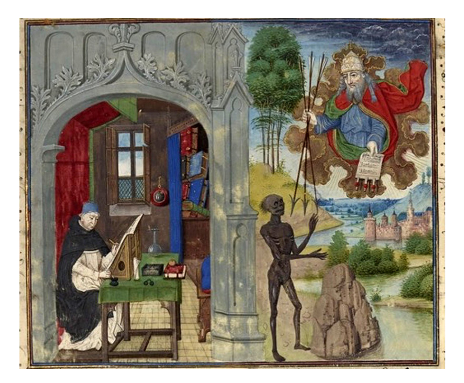
Fig. 10. SHS. Frontispiece. Paris, Bibliothèque nationale de France fr. 6275, fol. 1 r