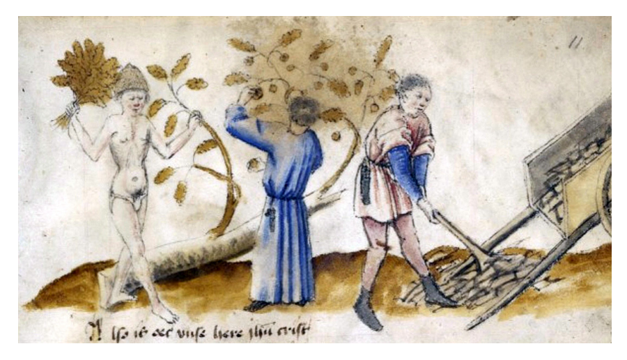
Fig. 9. Parable of the oak tree. (SHS, Prologue) Copenhagen, Kongelige Bibliotek GKS 79 folio, fol. 11 r