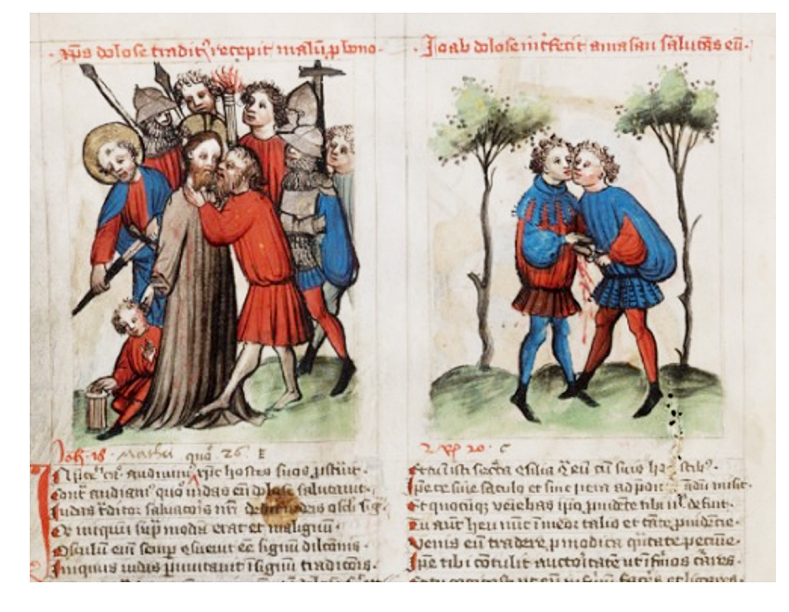
Fig. 3. Compositional parallelism of an antitype and types. Betrayal of Judas, Joab kills his brother Amasa (SHS 18 a–b). Sarnen, Benediktinerkollegium Cod. membr. 8, fol. 18 v

Fig. 2. Microstructure of the "canonical" SHS manuscript. The Presentation of Mary in the Temple (SHS 5 a–d). Berlin, Staatsbibliothek lat. fol. 329, fol. 5 v – 6 r