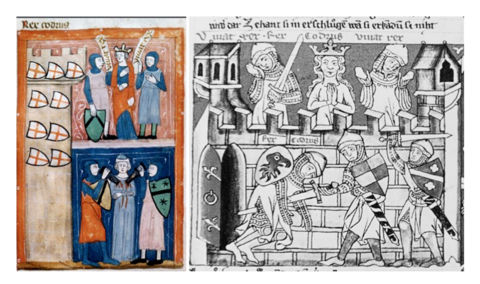
Fig. 1. The hieratic "iconic" "Italian" and narrative "Western" types of the SHS illumination. King Codrus of Athens lets himself be slain disguised as a common soldier to save his city (SHS 24 c) Rome, Biblioteca Corsiniana 55.K.2 (Rossi 17), fol. 35 r Source: The Warburg Institute Iconographic Database Kremsmünster, Stiftsbibliothek CC 243, fol. 30 r Source: The Warburg Institute Iconographic Database

tastes of the Bishop of Béziers), the process of the production of the manuscripts (for example, captions for illustrations including dog nickname, the lay-out of convolutes containing other manuscripts - for example, the SHS and the Book of Chess by Jacobus de Cessolis with similar didactic aim, written out by a single scribe and bound in a single convolute) and the history of use of such works (for example, redrawing of the depictions and readers' comments during the era of the Reformation). We also suggest a hypothesis regarding the influence of earlier depictions on the text of the Speculum. The historiated initial from the Cistercian manuscript made by the scriptorium of Stephan Harding, Citeaux abbey, with the depiction of a monk felling an oak tree with a lay brother in its crown – a motif, associated with the excerpt from Gregory the Great's Moralia on the Book of Job XXI – which corresponds to the depictions and meaning of the parable to be found in the Prologue of the Speculum about the oak tree chopped into pieces by monks as a metaphor for visual exegetics. The possibility, however, that this iconography was indeed transmitted still needs to be either proved or refuted, but this will be the task of future studies. Finally, the concept of the "implied iconography" proposed in the paper seems promising for studying possible gaps in iconographic programs on base of its parergonality and the frictions of the frame.