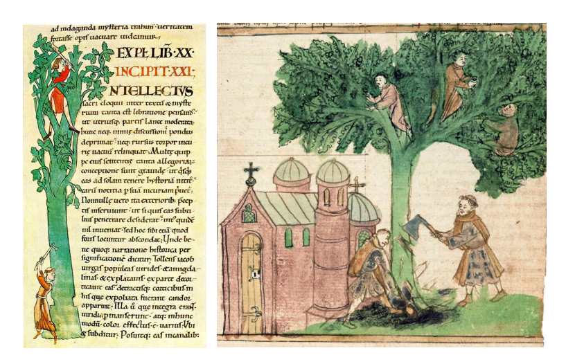
Fig. 12. Motif of monastic-labor in Cîteaux Moralia in Job and SHS. Historiated initial I (Intellectus) in the Gregory the Great's Moralia on the Book of Job, XXI. Dijon, Bibliotheque Municipale MS 173, f. 41 r Cîteaux Moralia in Job SHS, Prologue. Paris, Bibliothèque nationale de France lat. 9586, fol. 2r